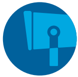
EXTERIOR / RIDE FAÇADE

Themed attractions offer the ultimate in immersive entertainment, exciting visitors with vibrant sights and sounds that export them to new worlds. To provide this experience, the technology must work together seamlessly as a cohesive solution. From exciting thrill rides to performances and concerts to restaurants and gift shops, HARMAN has the right technology to make every visit unforgettable.